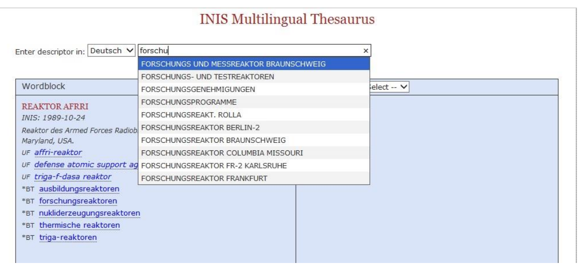
Fig. 3. INIS Thesaurus interface