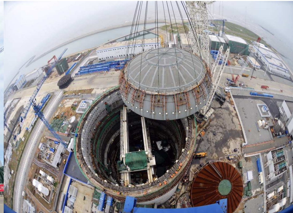
AP1000 Hiayang Project (Shandong Province)