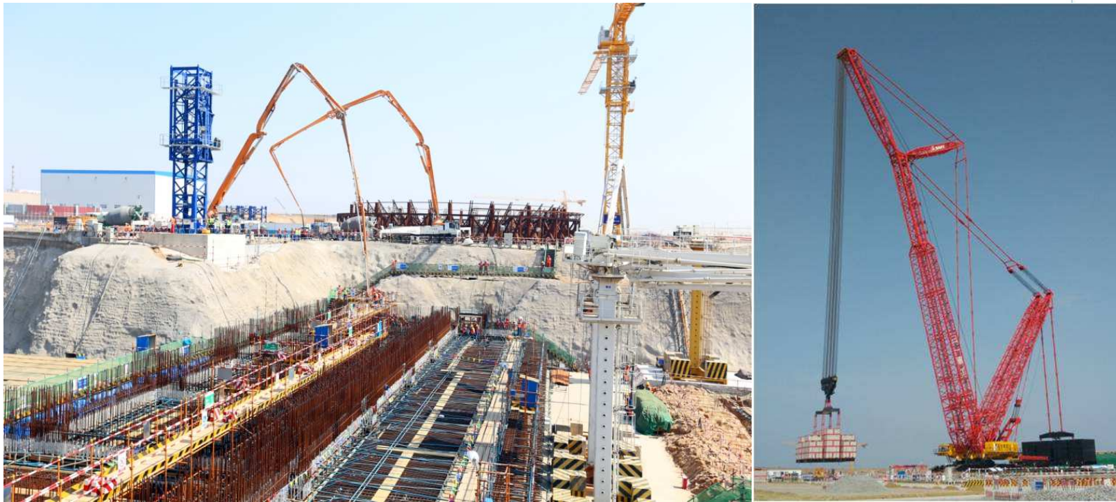
CAP1400 Demonstration Project (Rongcheng in Shandong Province)