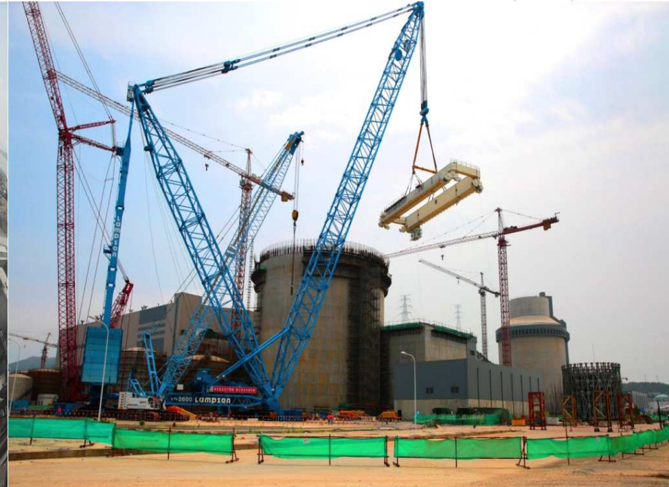
AP1000 Sanmen Project (Zhejiang Province)