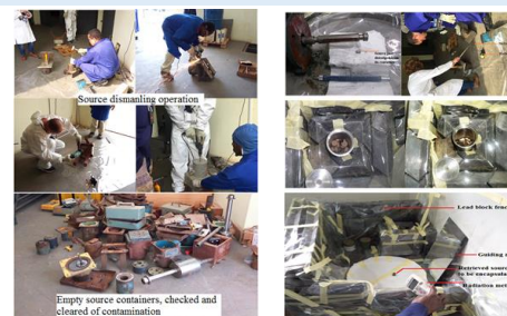
FIG. 2. Source conditioning activities